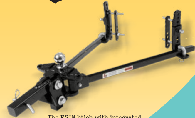
The E2™ hitch with integrated 2-Point Sway Control™